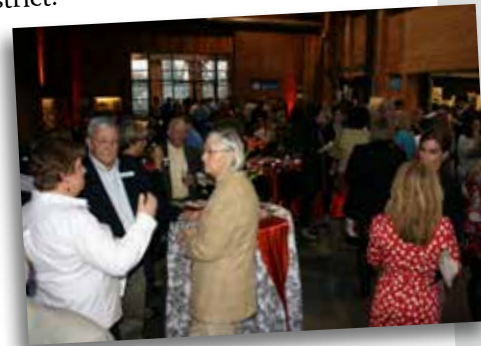
The York Suburban Education Foundation 2013 Celebration of Academic Excellence event, held April 6, 2013 at the Agricultural and Industrial Museum, raised over $40,000.